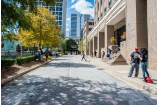
View from Courtland St.