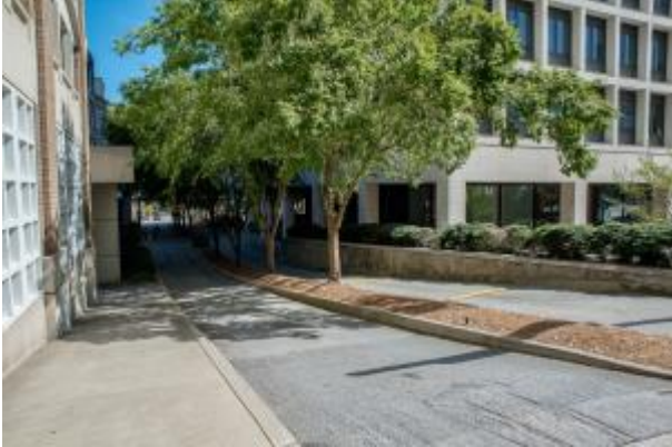
View from Peachtree Center Ave.