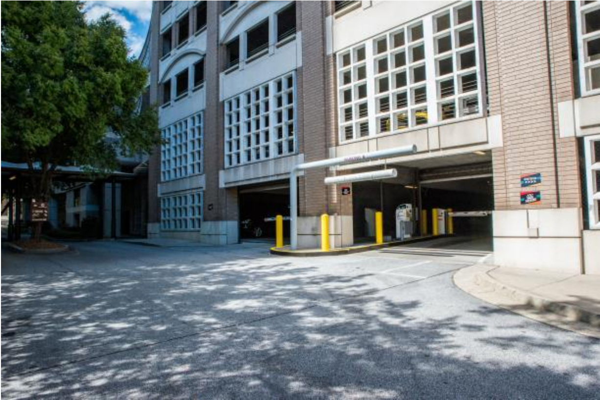
Lynch's Alley Entrance