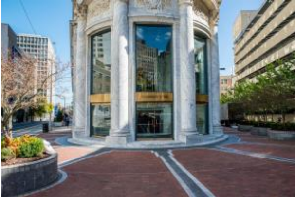
Edgewood Ave. & Hurt Plaza Entrance

There are 5 entrances into the Hurt Building. The entrances on Edgewood Ave. and Hurt Plaza SE are ADA accessible. If using an ADA entrance, please ring the buzzer and a security attendant will be called to open the door. The Starbucks has access to the main building.