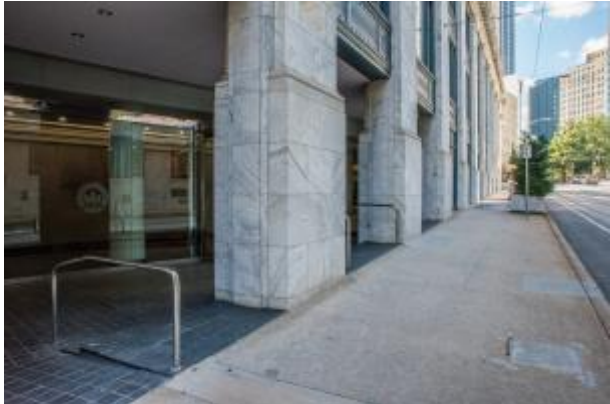
Edgewood Ave. ADA entrance